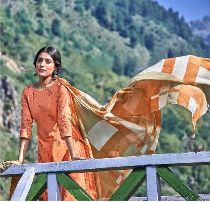
AN ARCHITECT FOR DESIGN, A SCULPTOR FOR SHAPE, A PAINTER FOR COLOR.