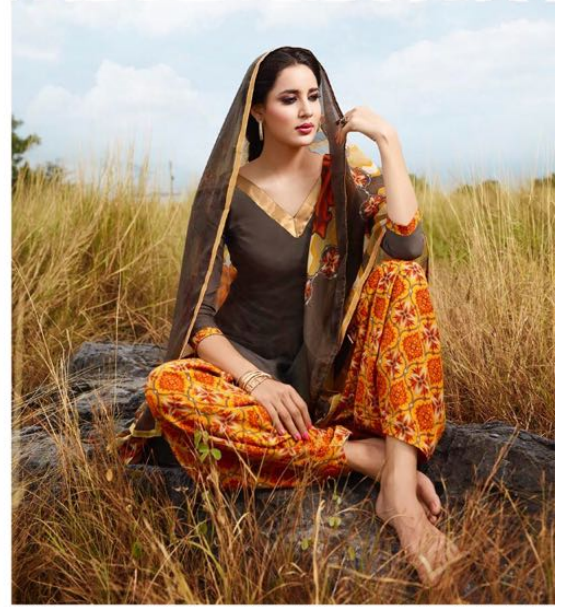
Catch the season's gorgeously feminine mood with design Collection and mesmerize the world with a beautiful combination of pure color and design printed and class dress.