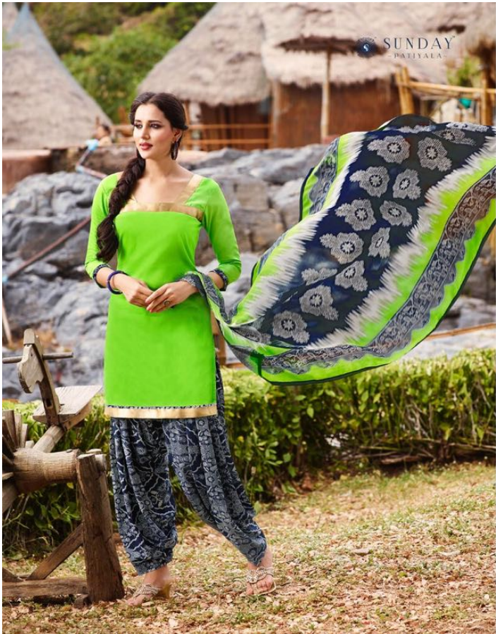
Now's the time to be little more adventures in prints and colours of your dress experience the exotic floral bliss in soft blue and green print which gives a sweetly feminine touch to your personality