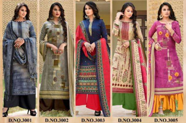
D.NO.3001 D.NO.3002 D.NO.3003 D.NO.3004 D.NO.3005