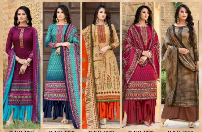
D.NO.3006 D.NO.3007 D.NO.3008 D.NO.3009 D.NO.3010