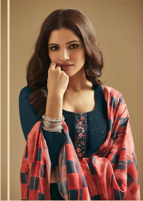
V - 45