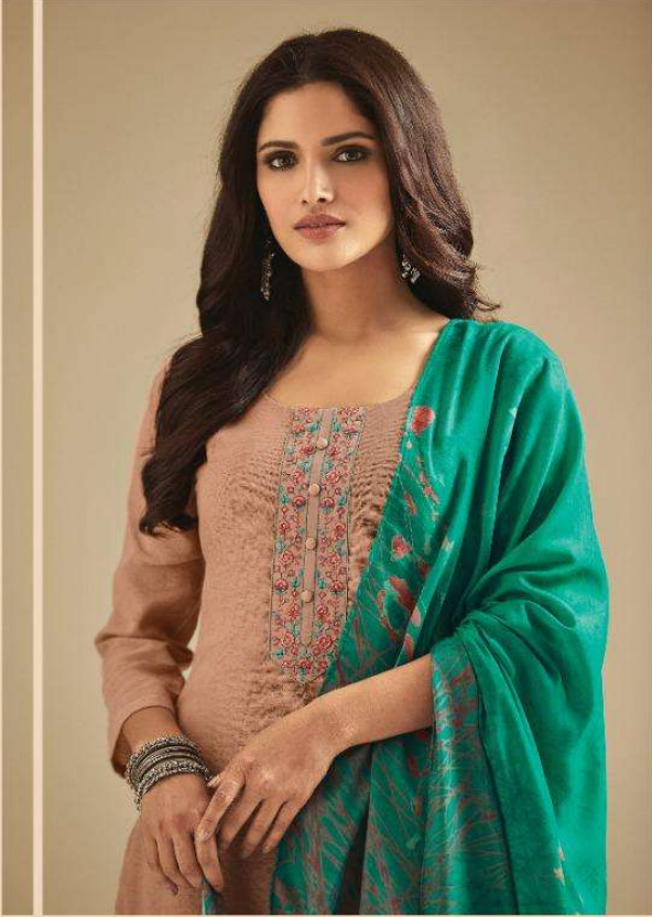
V - 44