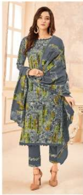
LOOK # 3006