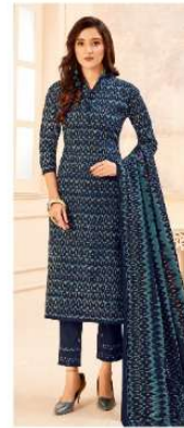
LOOK # 3009