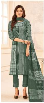
LOOK # 3001