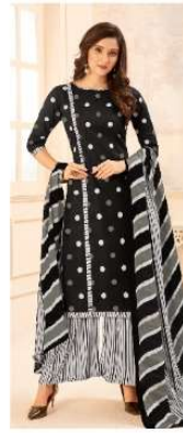
LOOK # 3004