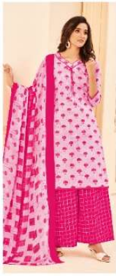
LOOK # 3002