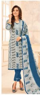
LOOK # 3003