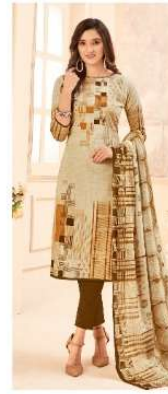
LOOK # 3005