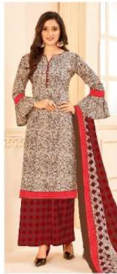
LOOK # 3007