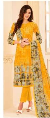
LOOK # 3010