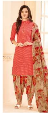
LOOK # 3008