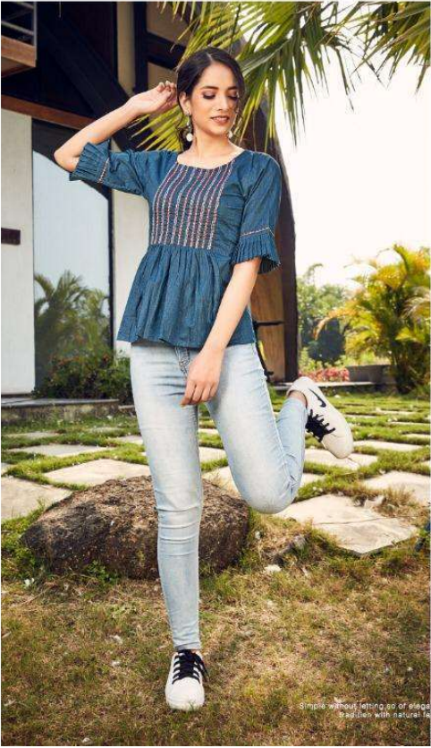
Simple without letting go of elegance & tradition with natural fabrics.