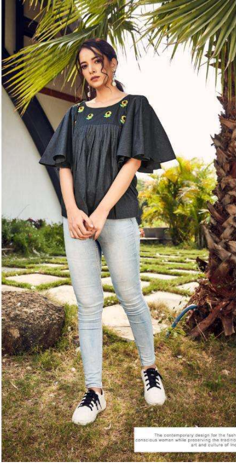
The contemporary design for the fashion conscious woman while preserving the traditional art and culture of India.