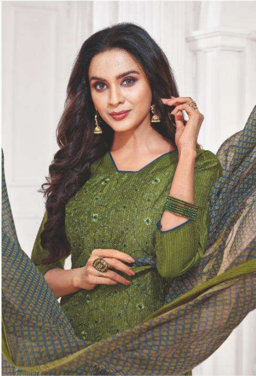
IT HAS A CLASSIC TIMELESS APPEAL THAT HAS STOOD TALL