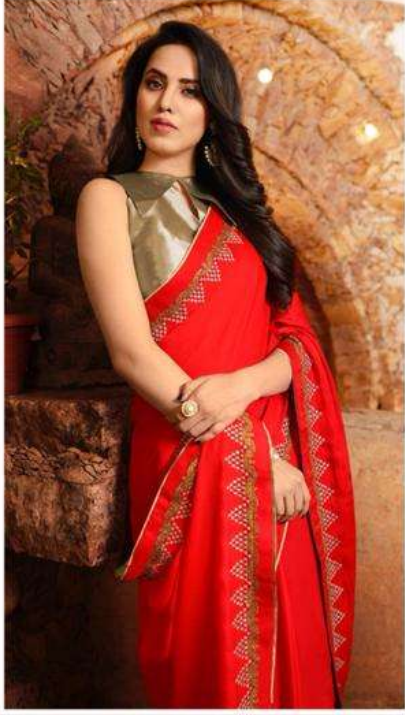
●●● Clove of this collection is here to find you a classy look, combining itself to another element, now it's all here ●●●