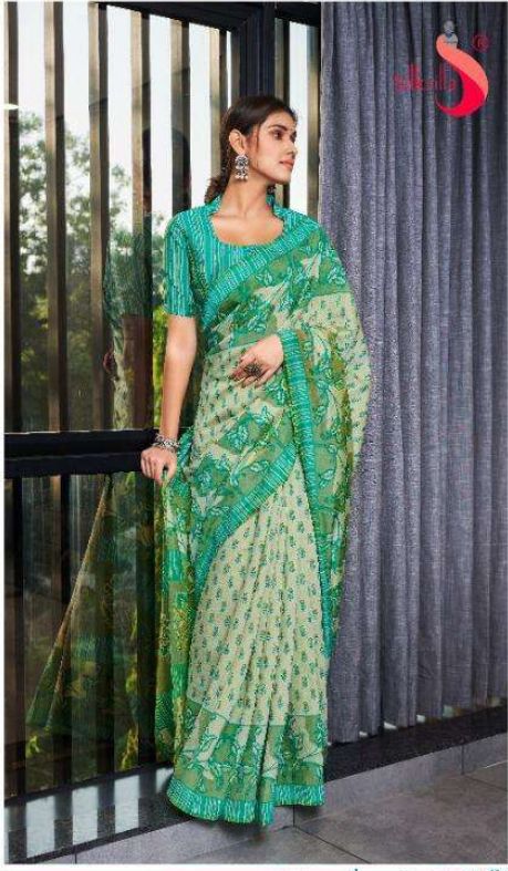
The glaring sun Bright, shimmering and bold saree with a lot of detail work D.NO-2106