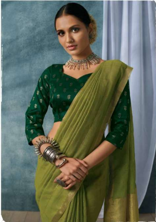
A touch of sophistication with exquisite designs for ethnic and indo-western wear.