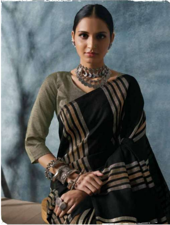
AN AFFAIR TO REMEMBER