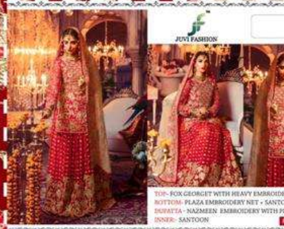
Emb Handwork Ghera Bottom