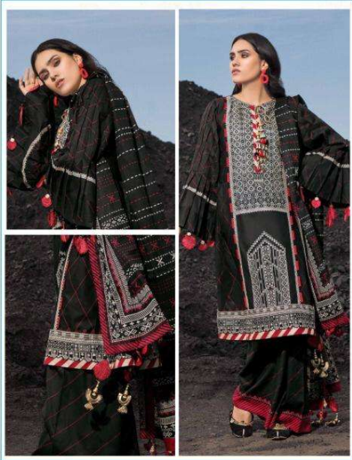
Riwayat-é-Pashk ❀❀❀ D.No.73005 ❀❀❀ GUL AHMED