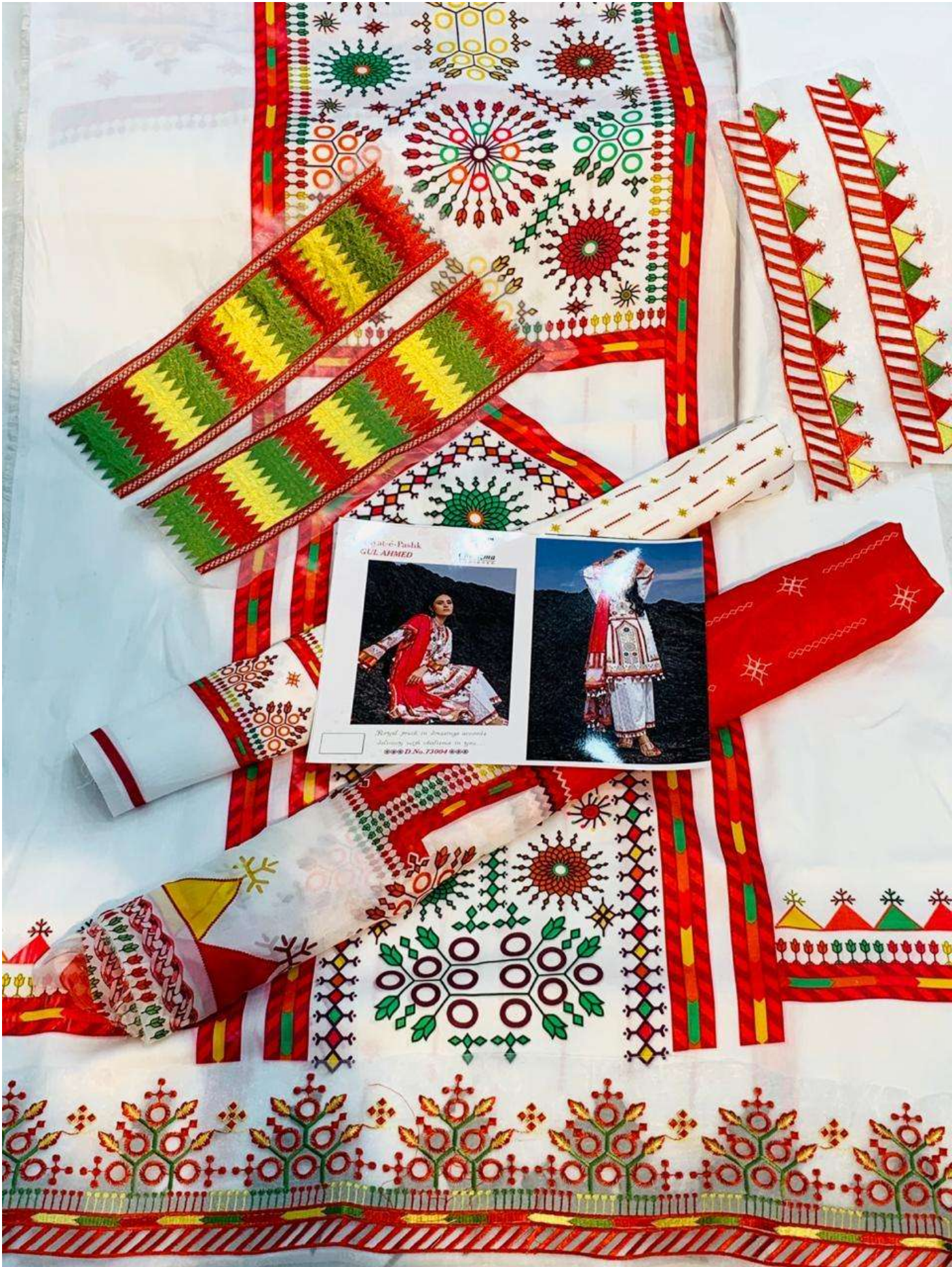
GUL AHMED Lily King Royal work in Amnaga women's jewelry with challenge in you D.No. 72004