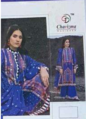
*** D.No. 73003 *** Riwayat-e-Pashk GUL AHMED