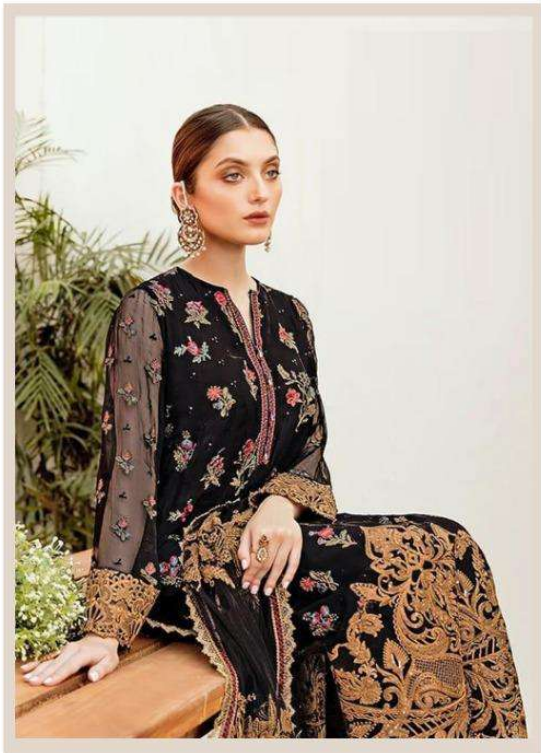
Top - Georgette heavy embroidered Inner Bottom - Santoon silk Dupatta - Butterfly net heavy embroidered