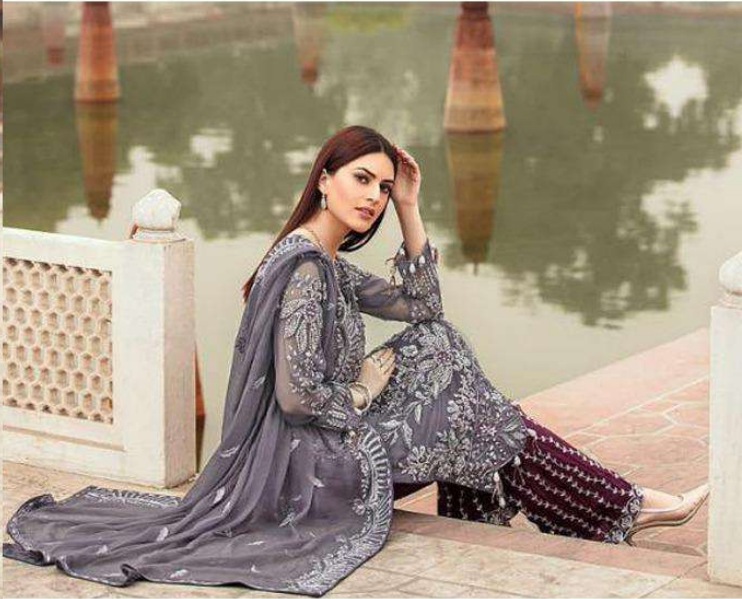
Top- Georgette heavy embroidered with daimond work Inner- Santoon silk Bottom- Santoon self embroidered Dupatta- Nazneen heavy embroidered