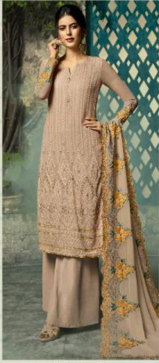
CODE / 241