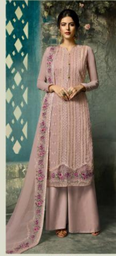
CODE / 244