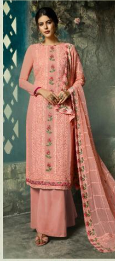
CODE / 242