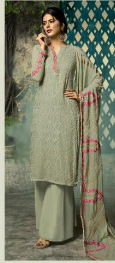
CODE / 243