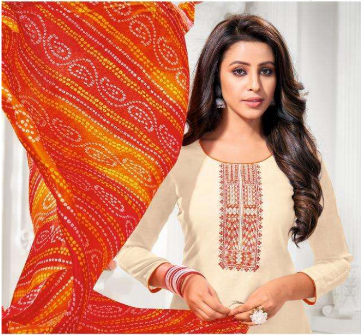
ELEVATO YOUR LOOK WITH THE FABULOUS COLOR 1009