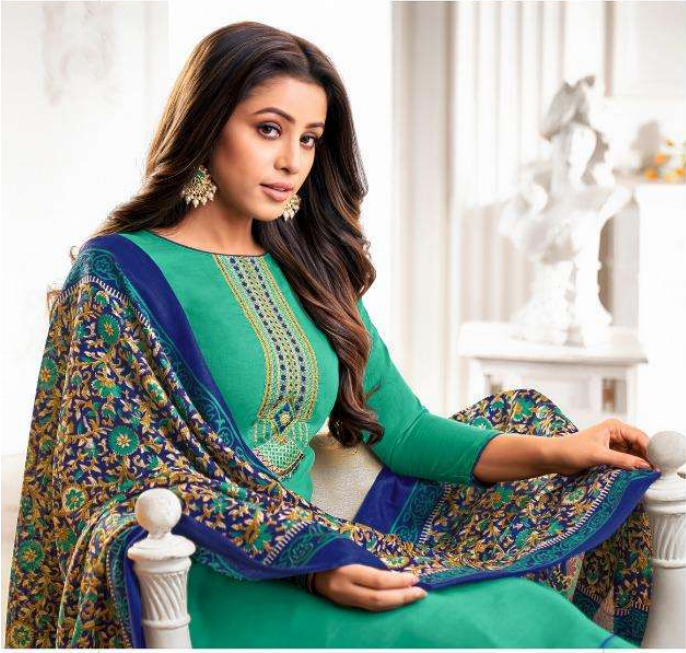
ELEVATO YOUR LOOK WITH THE FABULOUS COLOR 1008