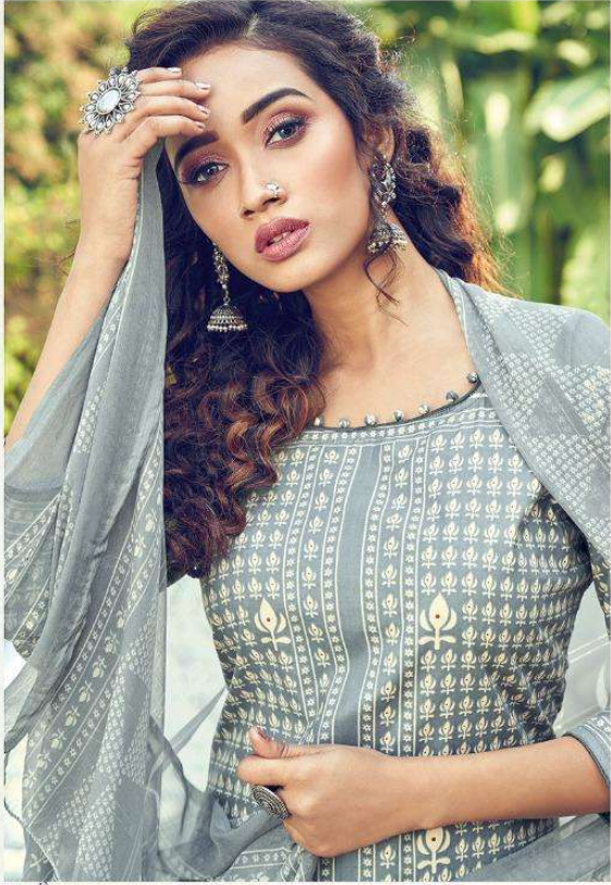
stock up on new fun prints that will take your breath away. 2002~