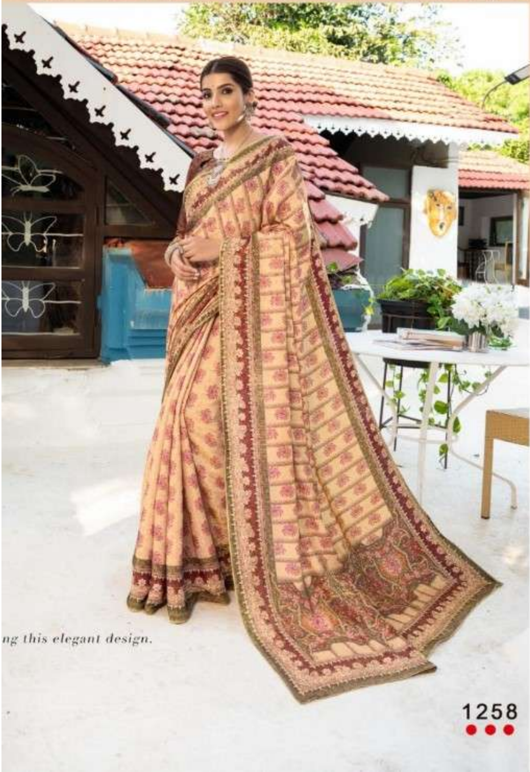
ng this elegant design.