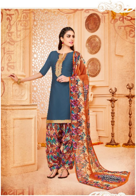
ELITE GATE FOR THE MOST ELEGANT