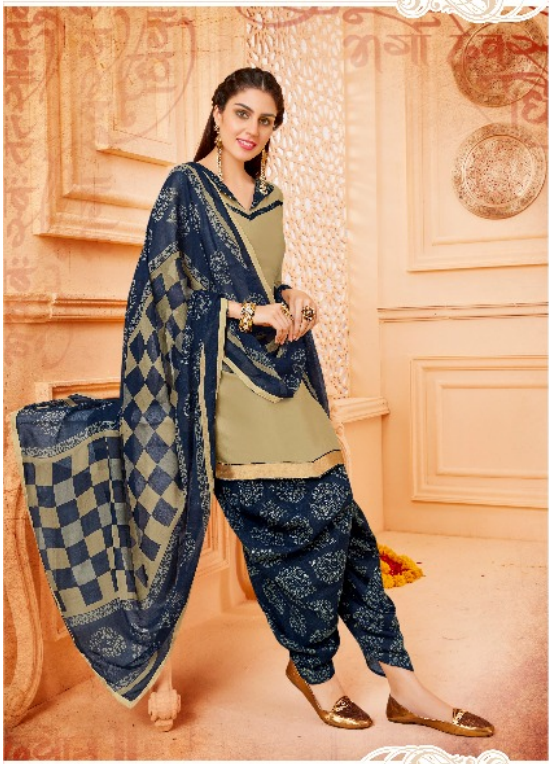
SELECT THE BEST OF YOUR FAVORITE WITH THE SUNDAY COLLECTION