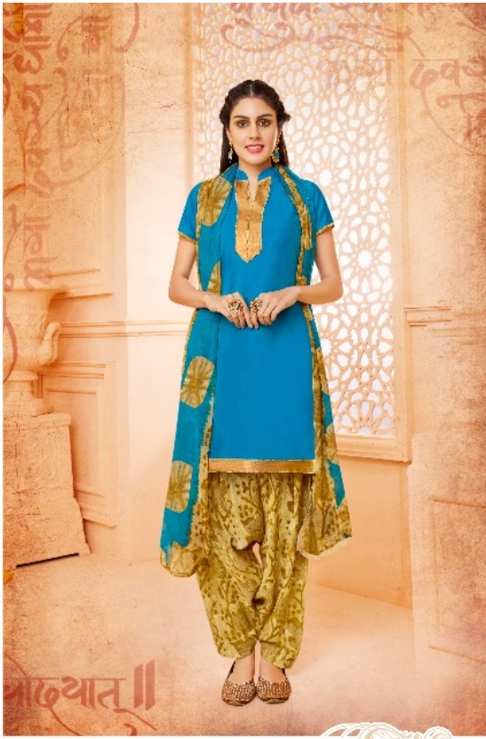
EXCLUSIVE "FOR THE MOMENT" AND SUSTAINABLE