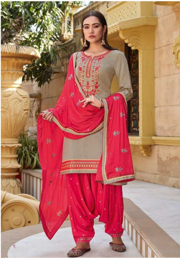
SOMETIMES YOU DON'T HAVE TO TRY TOO HARD TO LOOK DIFFERENT.