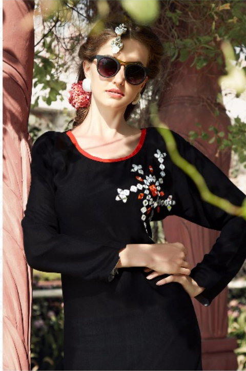
Glorious summer days are made for relaxing in the coziest weekend favourites: GulAhmed lawn collection is your partner in enjoying the soothing breeze.