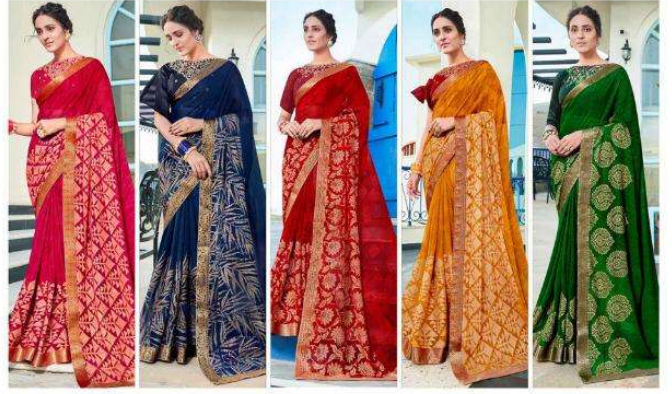
" 4001 "