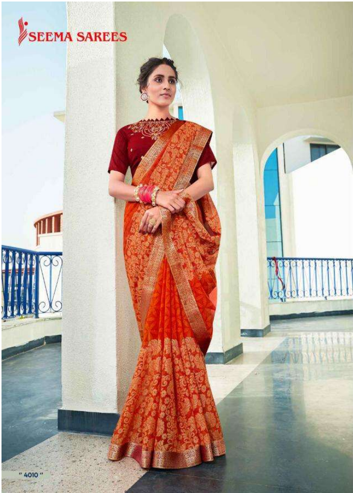
" 4010 "