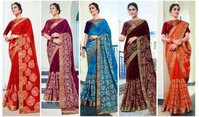
" 4006 "