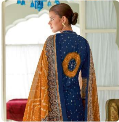
PARADISE TO OUR CULTURE