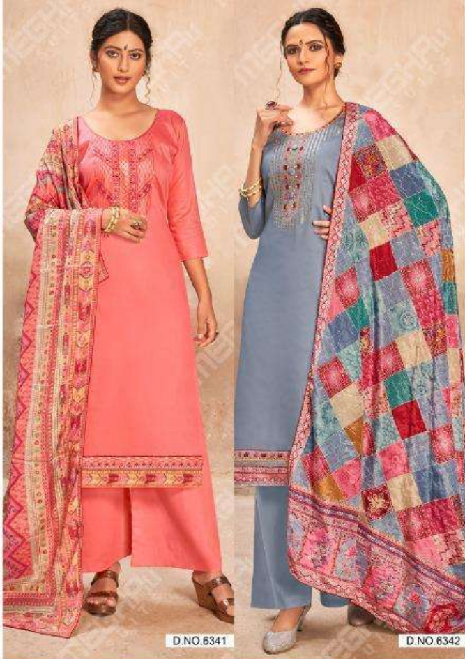
D NO 6341