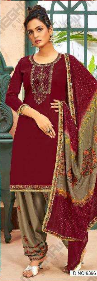
D NO 6396