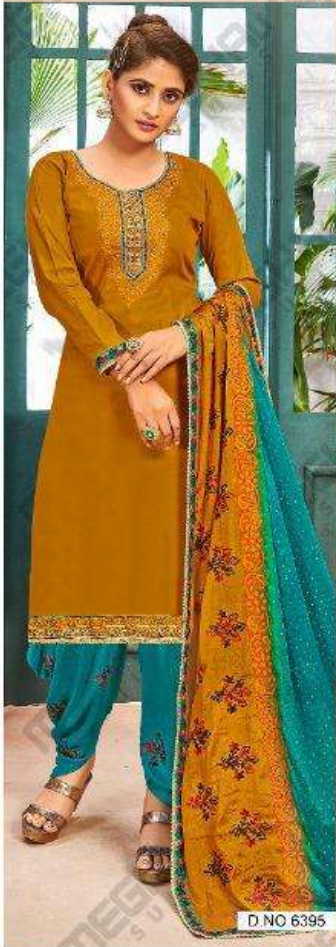
D NO 6395