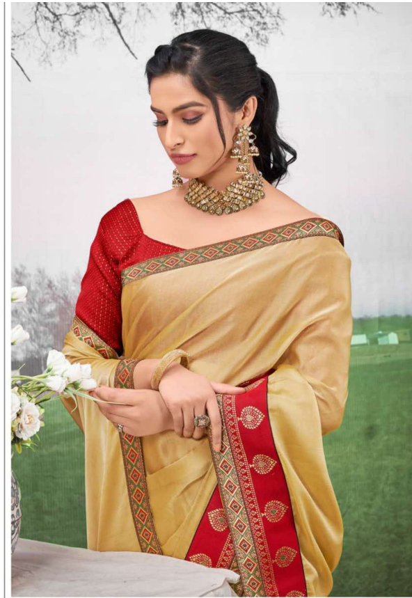
FLOWER CHILD THE CLASSIC PINKING FLORA IS THE FIRST OF THE RANGE, BUT THE USERS' LUXURIOUS CLOTHING IS THE FOUNDATION FOR GREAT BEAUTY IS HOW WE'RE CUT FROM IT. BRING THEIR MOST SOPHISTICATED