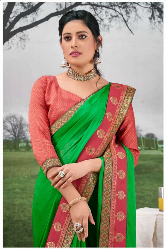
A GORGEOUS DRESS WITH CONTEMPORARY DESIGN WOULD ADD FRESHNESS AND STUNNING GLAMOUR TO THE LOOK.