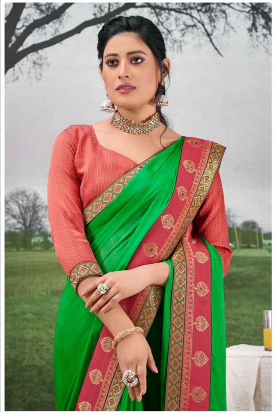
A GORGEOUS DRESS WITH CONTEMPORARY DESIGN WOULD ADD FRESHNESS AND STUNNING GLAMOUR TO THE LOOK.