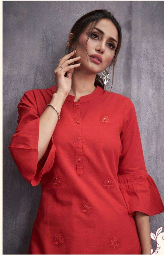
KURTI: COTTON SLUB WITH COMPUTER EMBROIDERY PALAZZO PANTS: COTTON LINA WITH ETHNIC BLOCK STATE PRINT