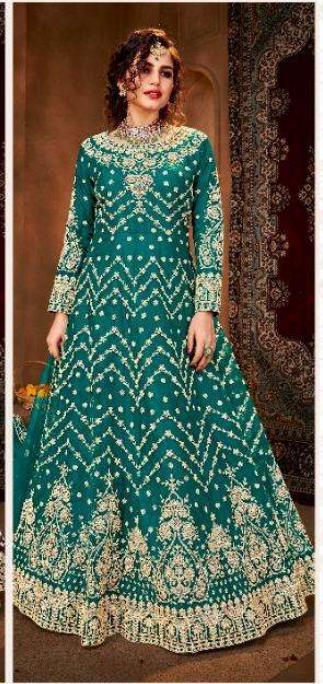
Design No. 2016-D