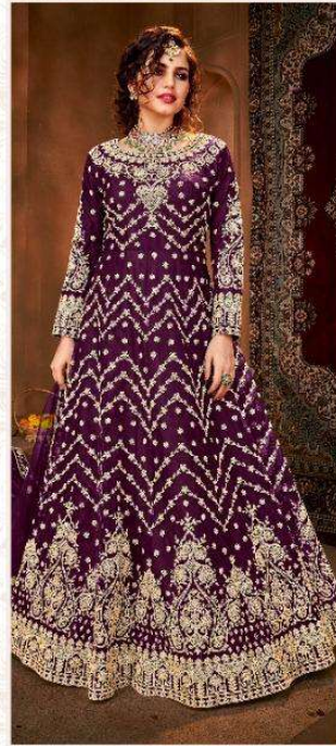
Design No. 2016-C