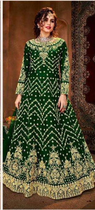
Design No. 2016-B