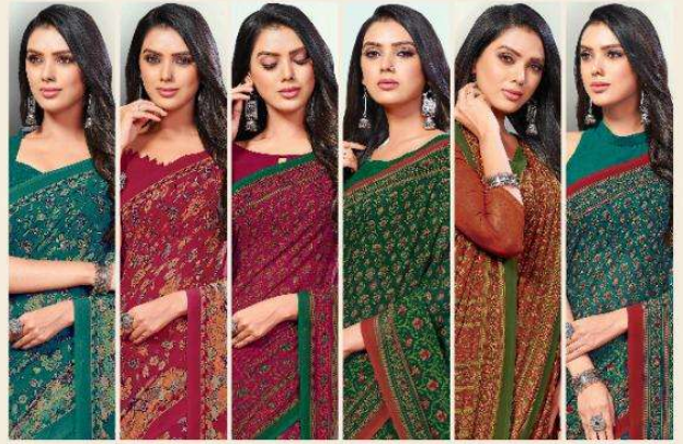
10704A 10704B 10705A 10705B 10706A 10706B