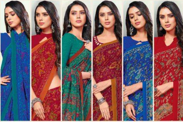
10701A 10701B 10702A 10702B 10703A 10703B