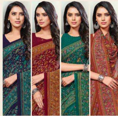
10709A 10709B 10710A 10710B