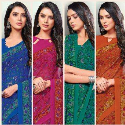
10707A 10707B 10708A 10708B