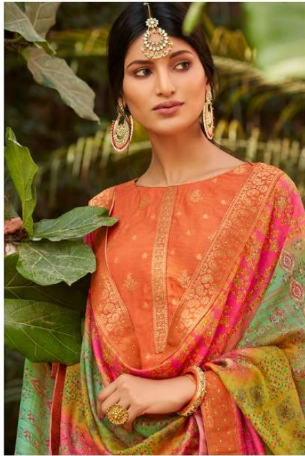
The pinnacle of urban celebration gets candid with this a soaring star