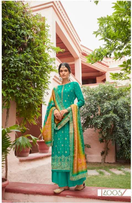
The parade of urban celebration gets candid with this a blaring note