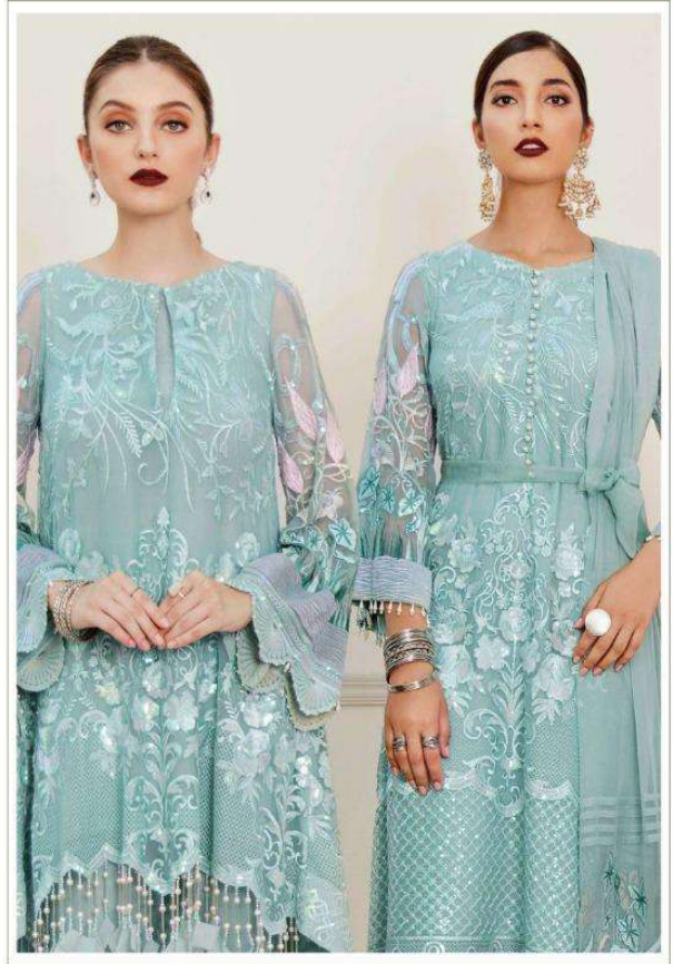
Top - Georgette heavy embroidered Inner Bottom - Santoon Silk Dupatta - Butterfly Net Heavy embroidered