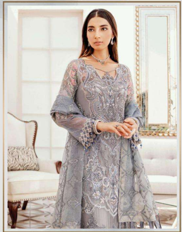
Top - Butterfly net heavy embroidered Inner Bottom - Santoon silk Dupatta - Butterfly net heavy embroidered