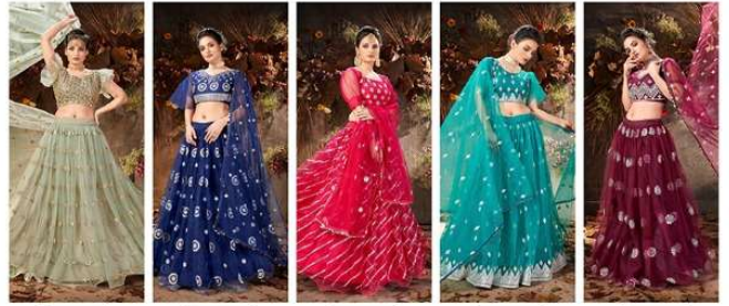
• 1066 •