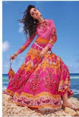
• 204 •