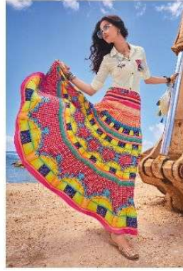
• 205 •