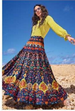
• 202 •