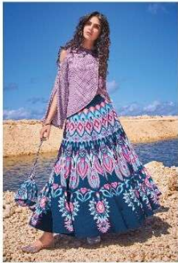
• 203 •