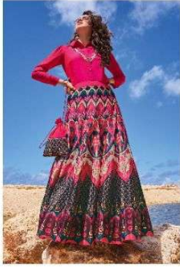
• 201 •