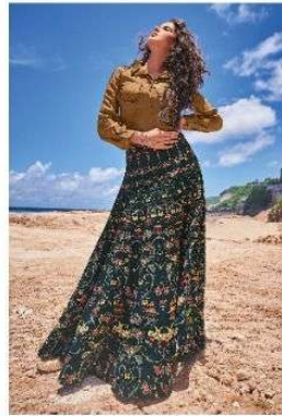
• 206 •