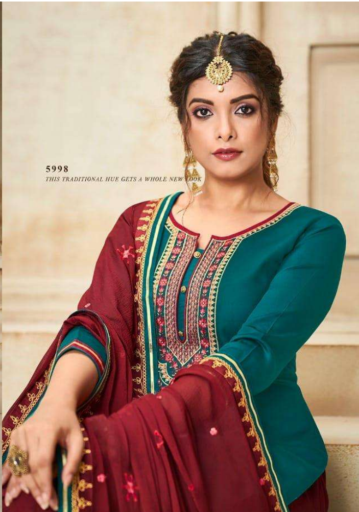
5998 THIS TRADITIONAL HUE GETS A WHOLE NEW LOOK