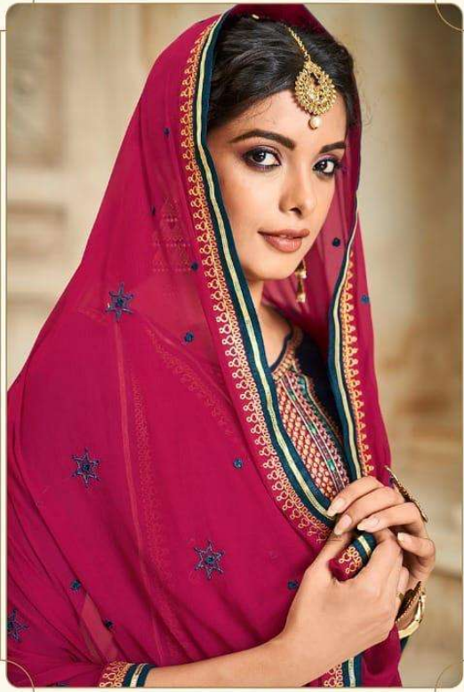
DEFINE YOUR MOODS WITH DISTINCTIVE SILHOUETTES 5995