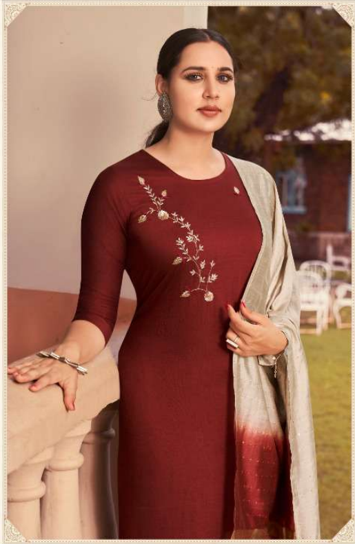
INDIAN STYLE This season, give your gown a touch of elegance with just a little attention to detail. 1287