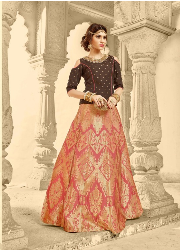
Skirt With Choli