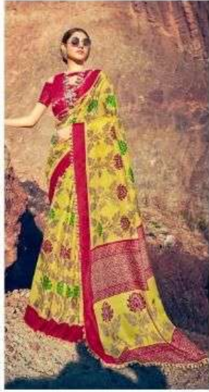
W T -02