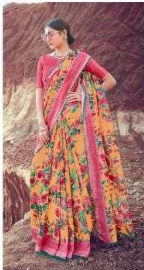
W T -10