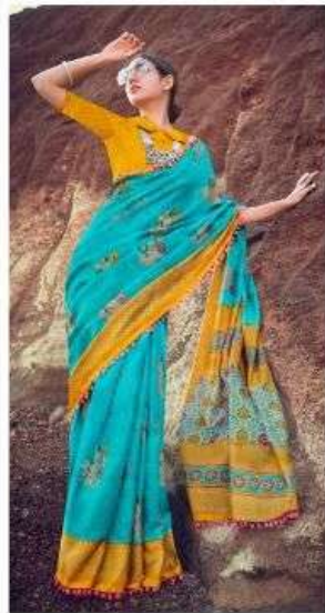
W T -11