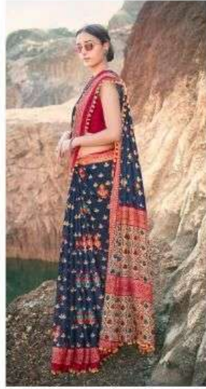
W T -03