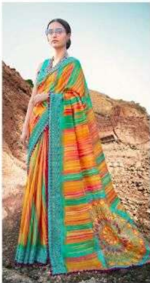
W T -09