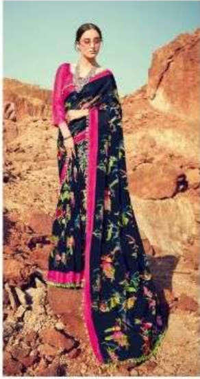
W T -01