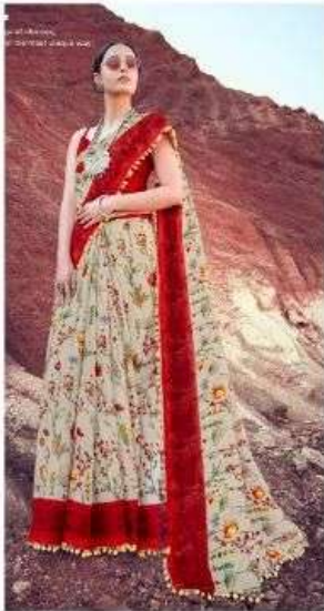
W T -05