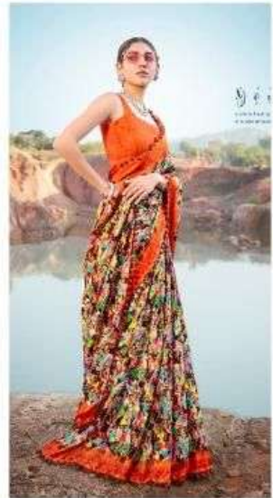
W T -08