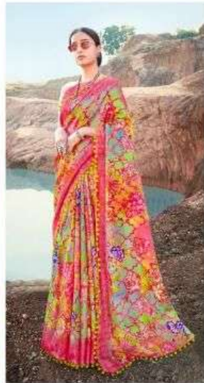
W T -07