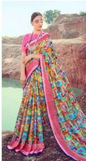
W T -06