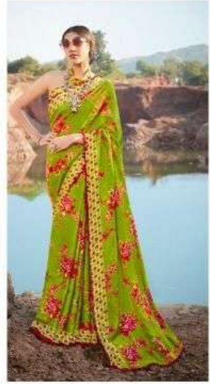
W T -04