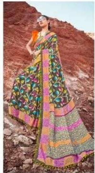
W T -12