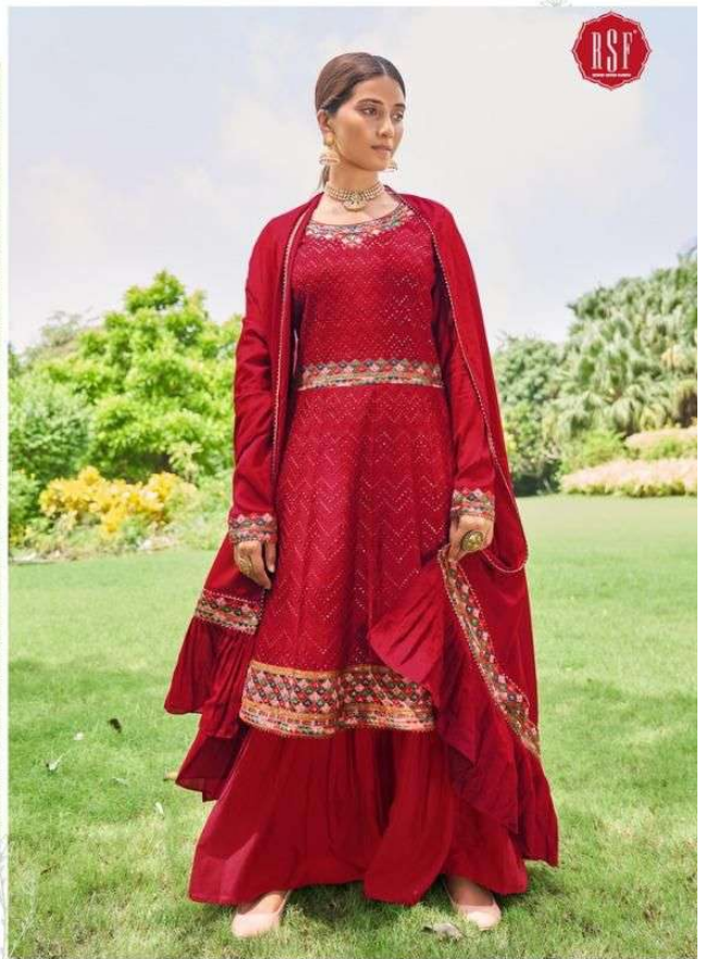
19804 Anyone Who Never Made A Mistake Never Tried Anything New.

3710 CONSUMER PASTORAL THE GREAT BEAUTY THE MANY FACES OF BEAUTY... THE NEW IN YOUR CLOSET FOR THE ATTRACTIVE COLLECTION