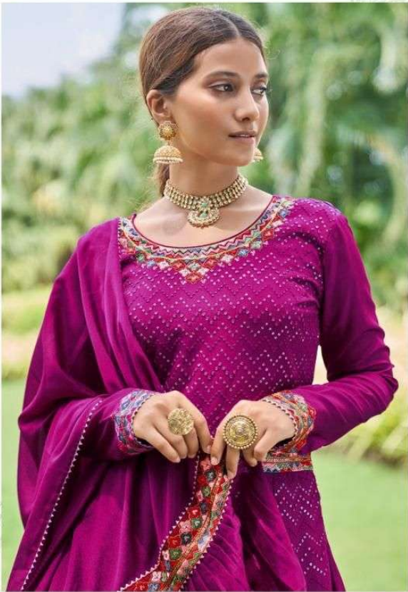
It is fancy Rather Than Taste Which Produces So Many New Fashions.

Brighter than the reddest ruby, more precious than the most beautiful diamond.