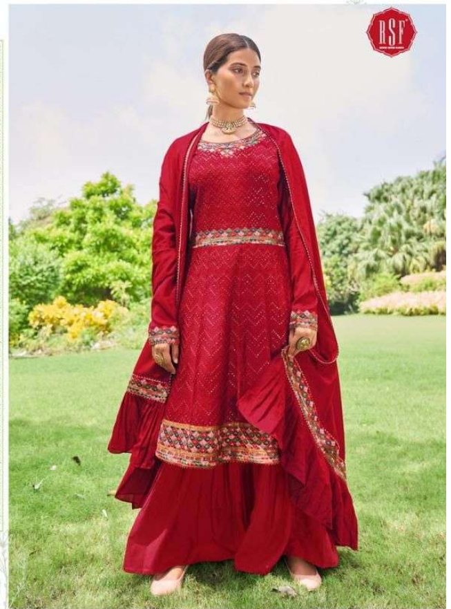
19804 Anyone Who Never Made A Mistake Never Tried Anything New.