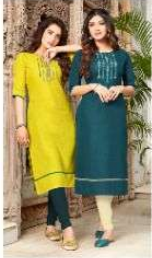
AR 40-AR 41