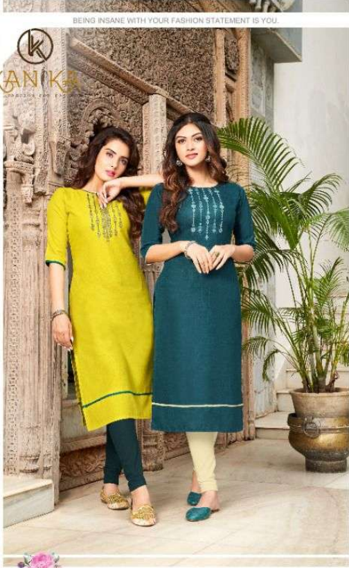
AR 40-AR 41