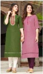
AR 46-AR 47