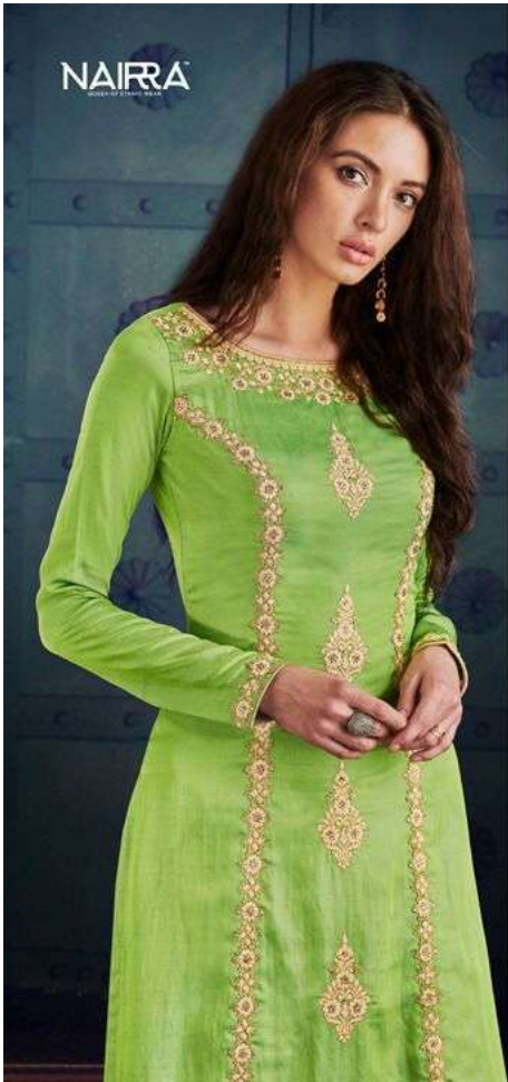
Straight suit with pants. Top in Green Silk fabric with bottom in foil print Santoon in Bottol Green colour, Dupatta in Bottol Green Chiffon, D. NO : 1042-B