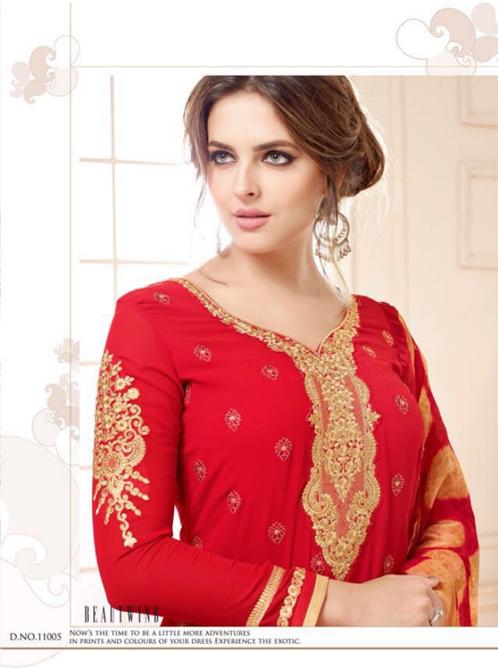
BEAUTIFUL D.NO.11005 NOW'S THE TIME TO BE A LITTLE MORE ADVENTURES IN PRINTS AND COLOURS OF YOUR DRESS EXPERIENCE THE EXOTIC.