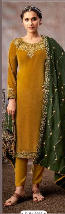
• D.No.2006 •