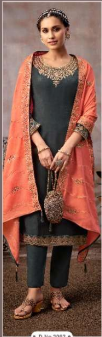
• D.No.2002 •