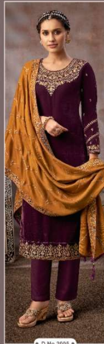
• D.No.2005 •