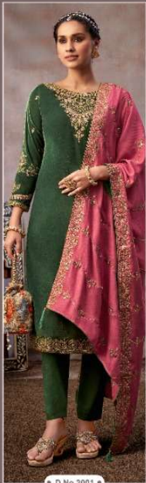
• D.No.2001 •