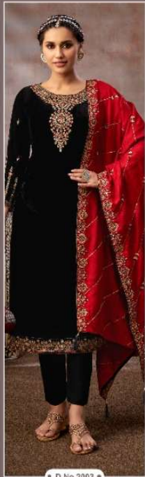
• D.No.2003 •