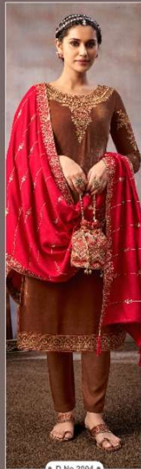
• D.No.2004 •