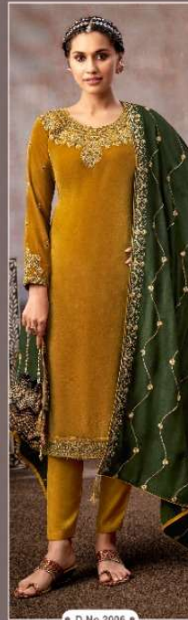
• D.No.2006 •