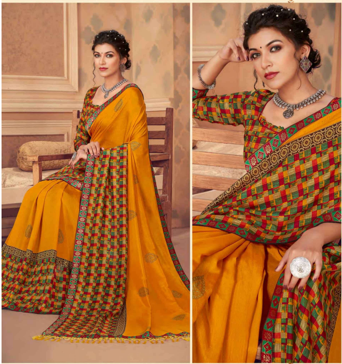
Embrace womanly attire that take inspiration from the feminine of the tradition swatting its way to a season invited with imagination fabulous designs to look beautiful.