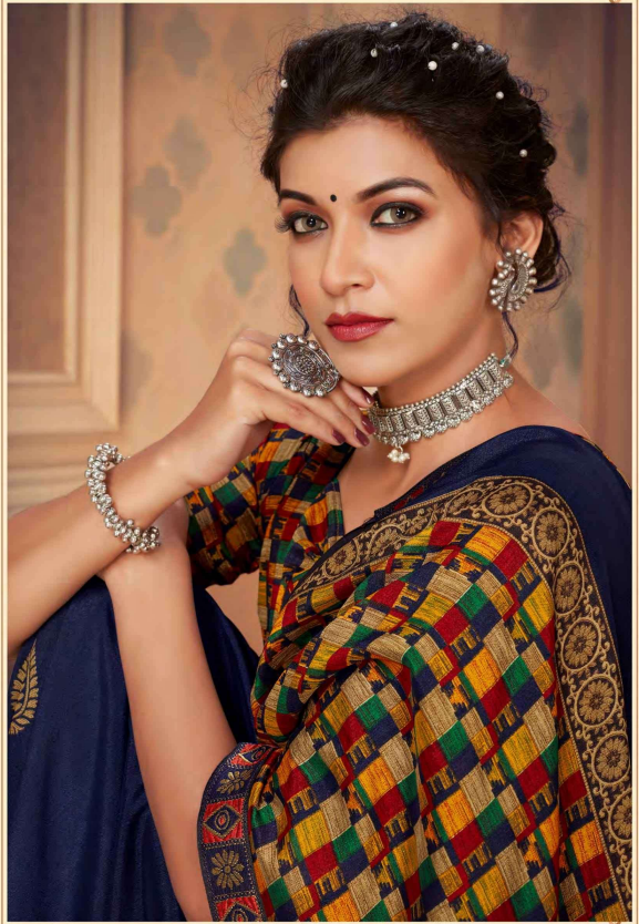
The beauty of the Indian women with gracefully drops in effulgent sarees..