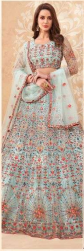
D.No. 1039 ← ୧୧ →