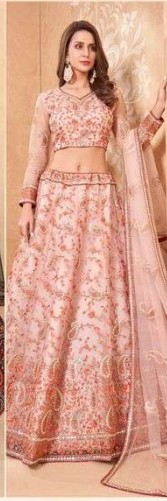
D.No. 1046 ← ୧୩ →