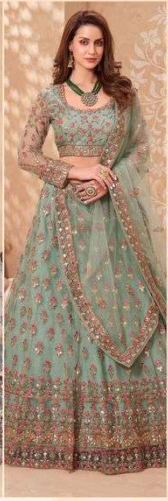
D.No. 1041 ← ୧୧ →