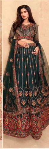
D.No. 1045 ← ୧୧ →