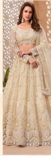
D.No. 1043 ← ୧୧ →