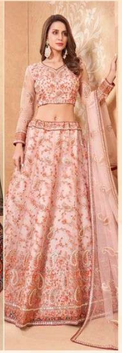
D.No. 1046 ← ୧୧ →