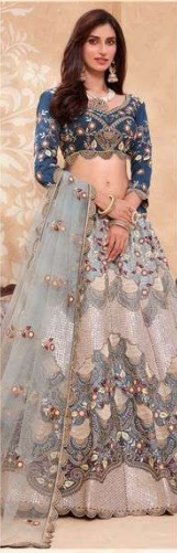
D.No. 1040 ← ୧୧ →