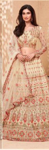
D.No. 1044 ← ୧୧ →