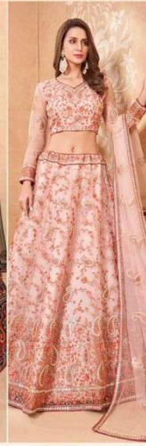
D.No. 1046 ← ୧୧ →