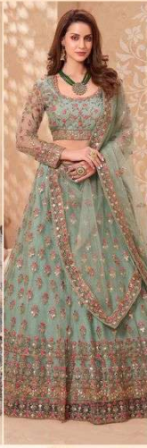
D.No. 1041 ← ୧୧ →