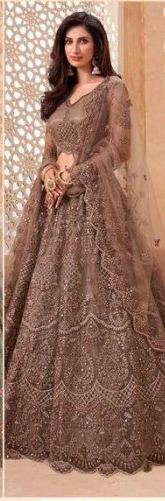
D.No. 1042 ← ୧୧ →