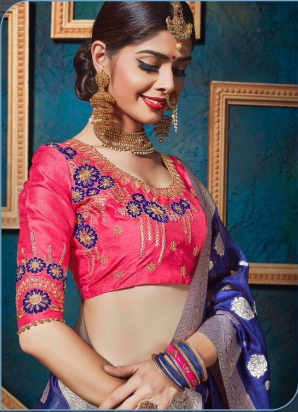
This sparkling beauty of saree will work magic on everything in your wardrobe.