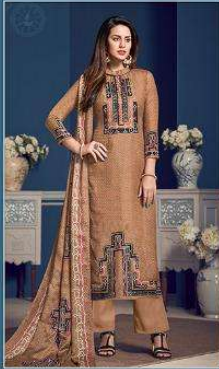
D. No. 29003