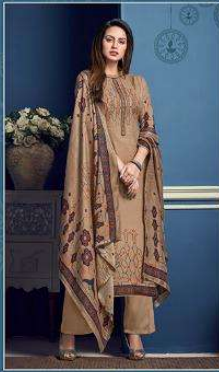
D. No. 29001