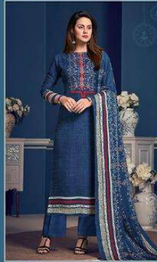
D. No. 29004