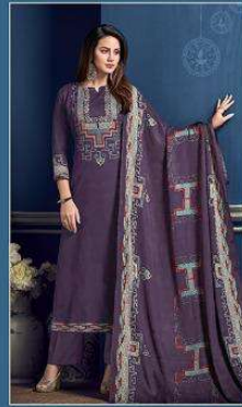
D. No. 29005