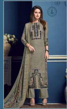
D. No. 29006