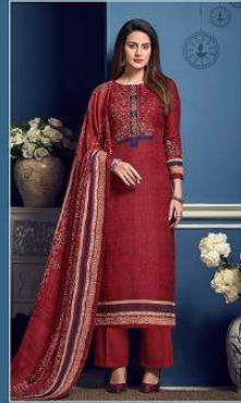
D. No. 29007