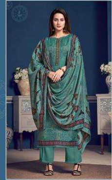
D. No. 29008