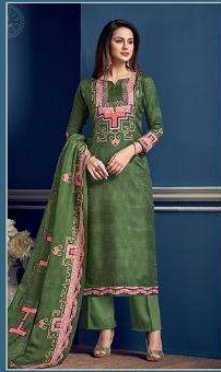
D. No. 29002