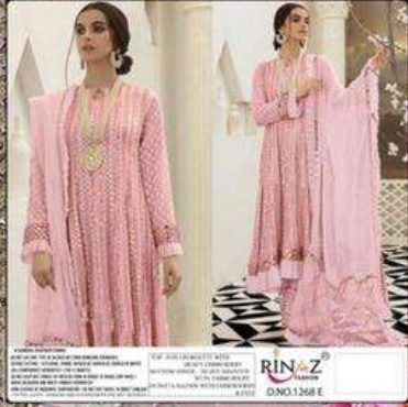
Emb Chiffon Dupatta With Frills