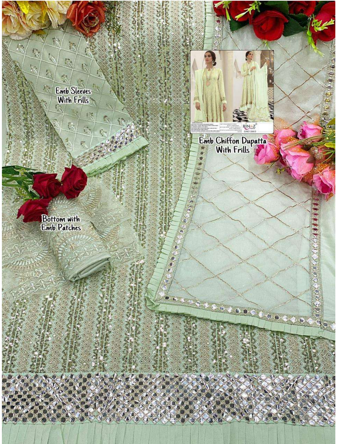
Emb Sleeves With Frills