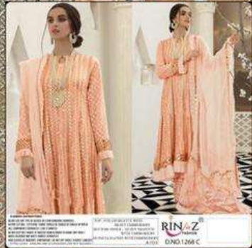
Emb Chiffon Dupatta With Frills