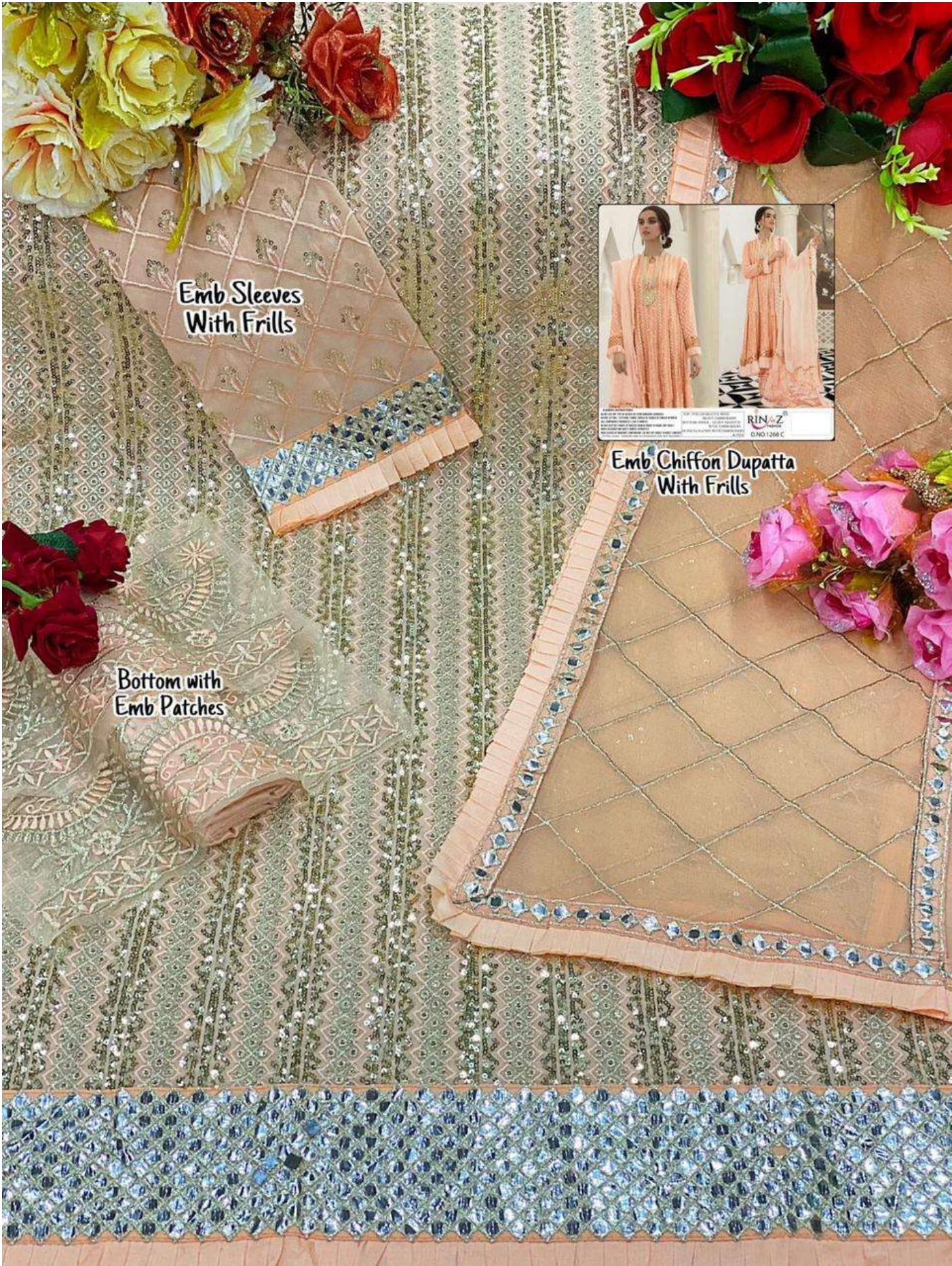
Emb Sleeves With Frills