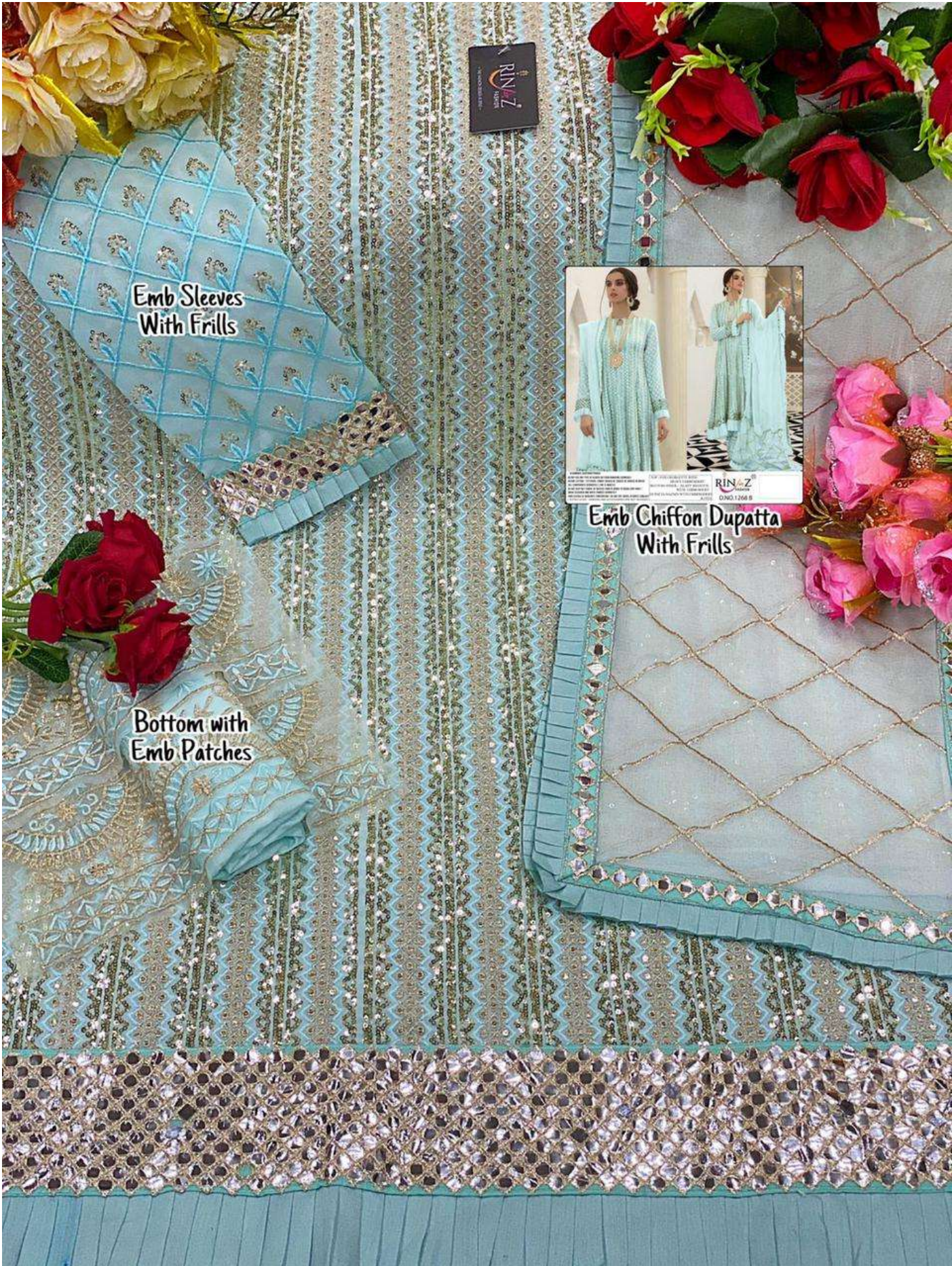
Emb Sleeves With Frills