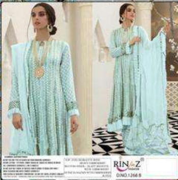
Emb Chiffon Dupatta With Frills