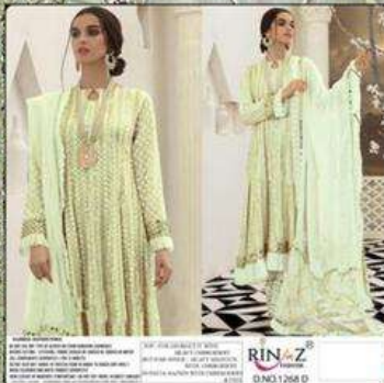
Emb Chiffon Dupatta With Frills