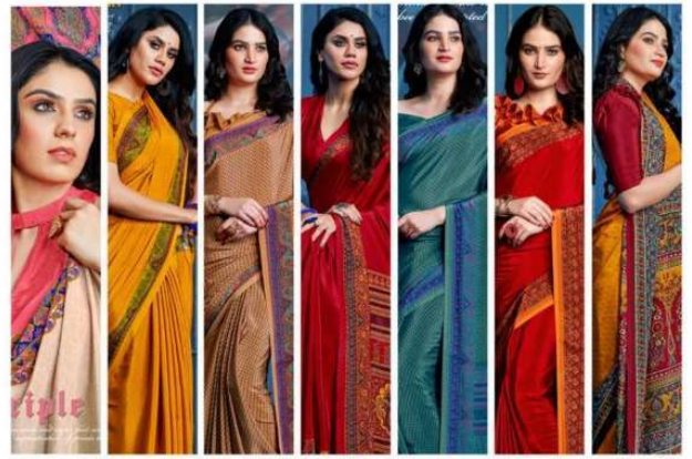
8807 C 8808 A 8808 B 8809 A 8809 B 8812 B 8814 A