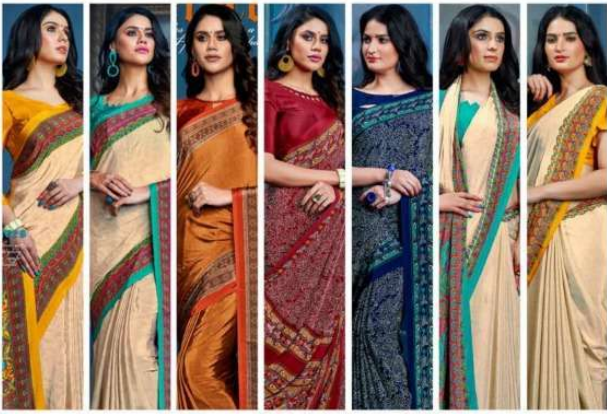
8804 A 8804 B 8805 A 8806 B 8806 C 8807 A 8807 B