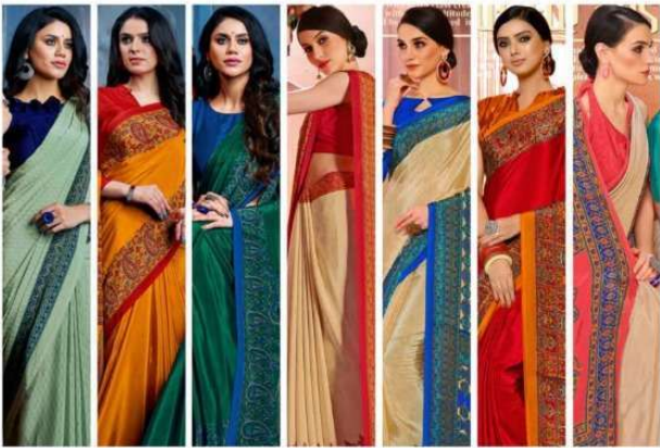
8814 B 8817 B 8817 C 8605 A 8605 B 8606 B 8612 A