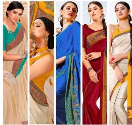
8612 B 8612 C 7607 B 7610 A 7611 C