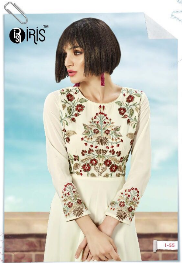
Celebrate your sophisticated side with the festival collection's intricate embroidery and elaborate design with its stunning crystal work and stylish borders, you'll surely be in the spotlight!