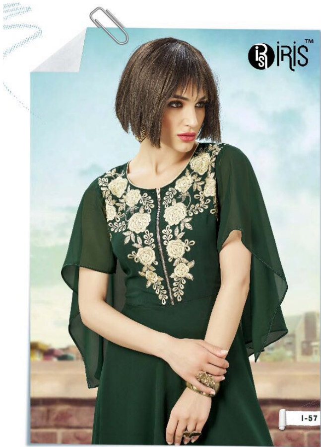
Celebrate your sophisticated side with the festival collection's intricate embroidery and elaborate design with its shimmering crystal work and stylish border. You'll surely be in the spotlight!