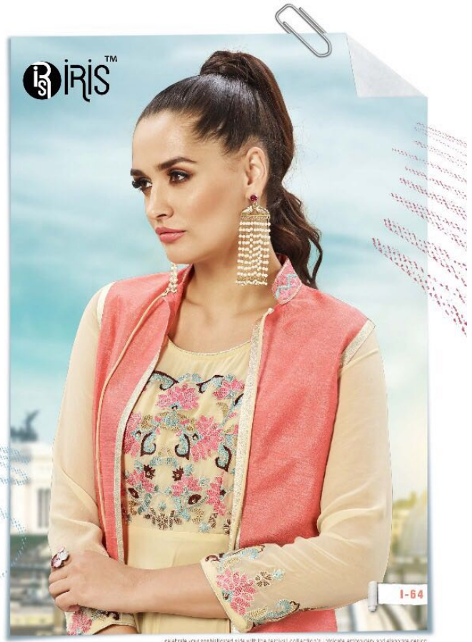
celebrate your sophisticated side with the festival collection's intricate embroidery and elaborate design with its stunning crystal work and stylish borders, you'll surely be in the spotlight!