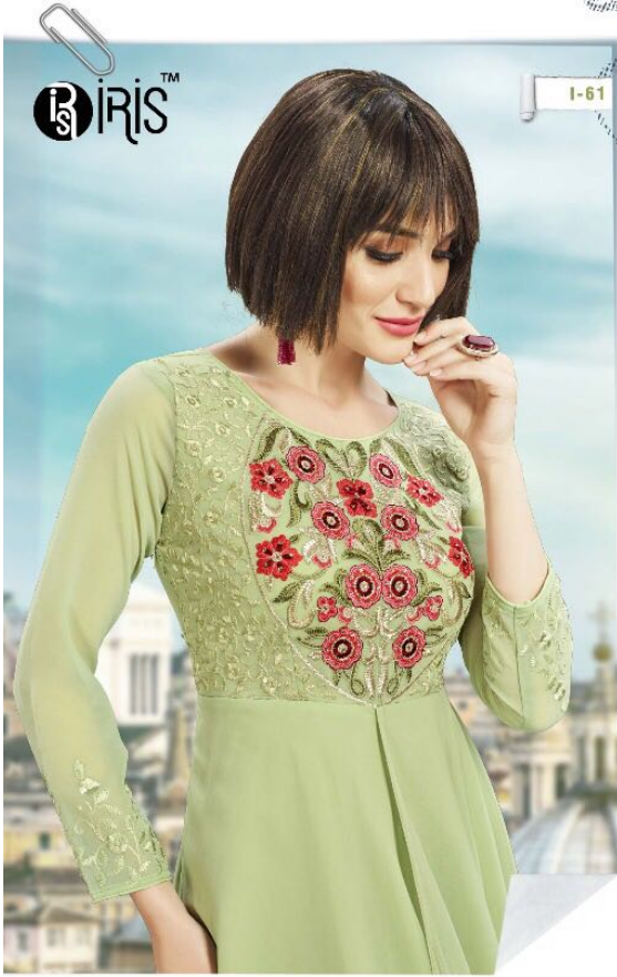
creativity can give inspiration to us. Our desire is to create one-of-a-kind designs for beautiful lady.