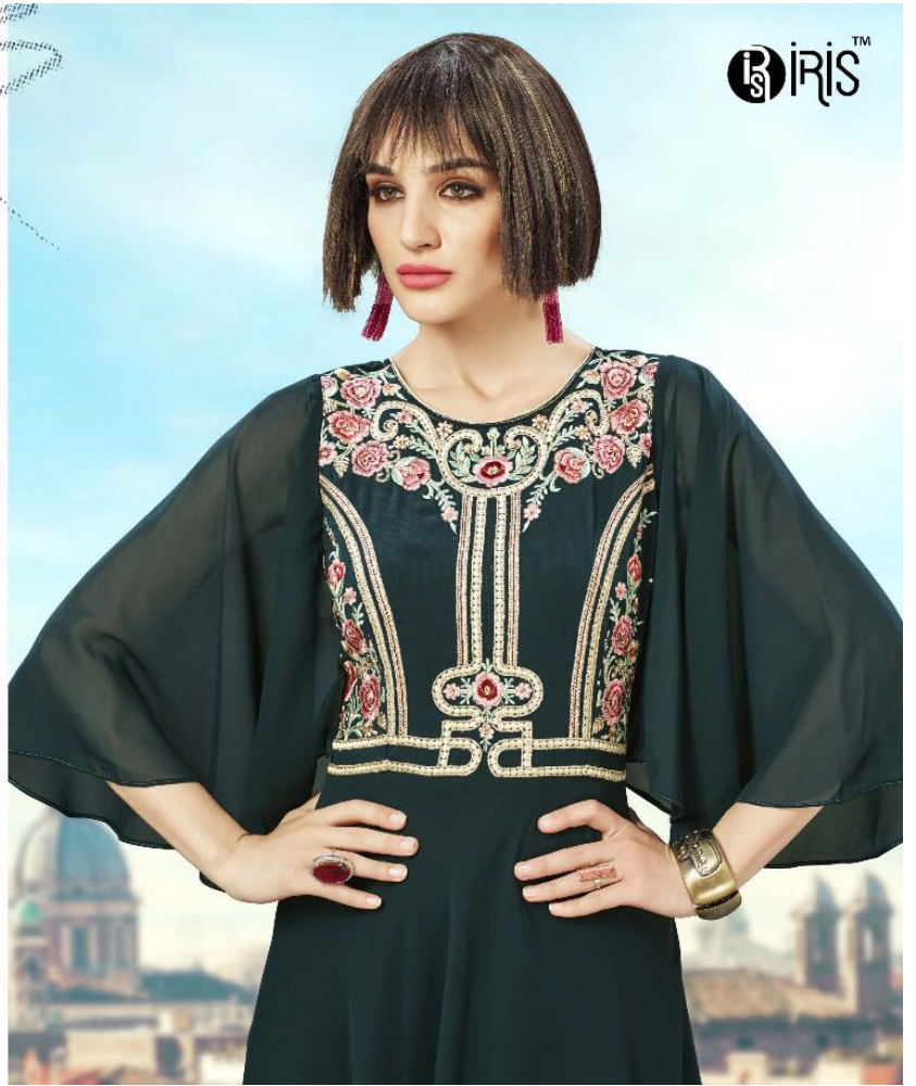
celebrate your sophisticated side with the best of collection's intricate embroidery and elaborate design with its shimmering crystal work and stylish bonnet, you'll surely be in the spotlight!