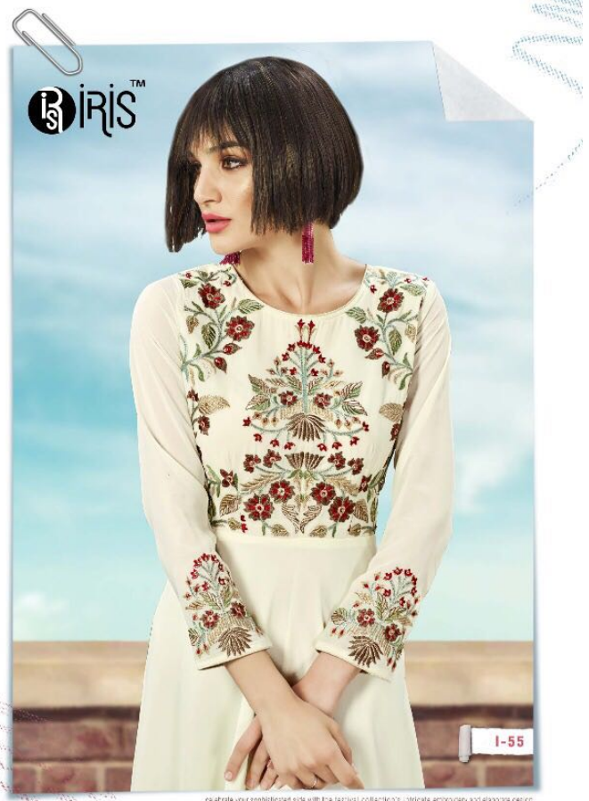
Celebrate your sophisticated side with the festival collection's intricate embroidery and elaborate design with its stunning crystal work and stylish borders, you'll surely be in the spotlight!