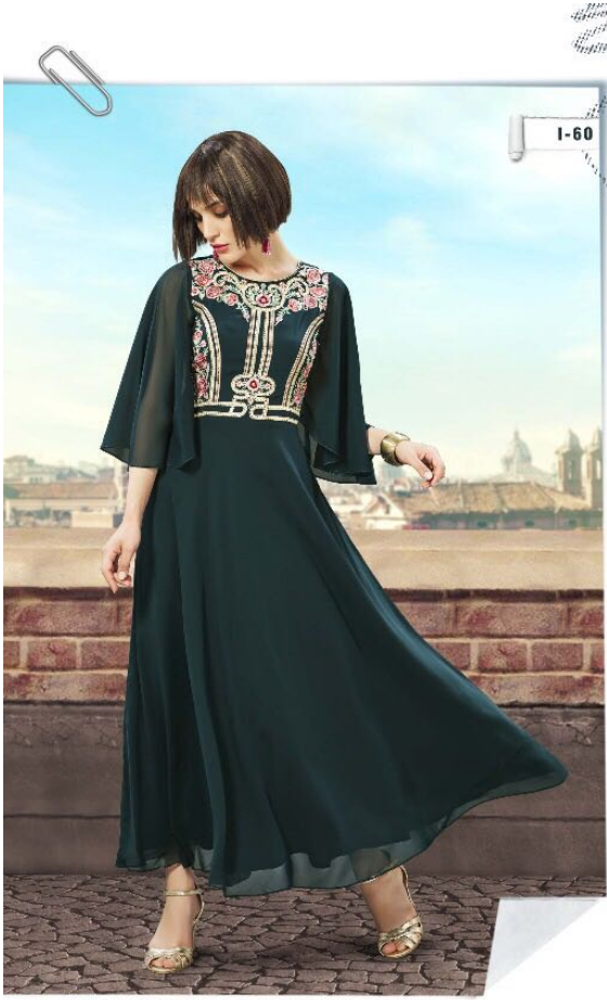
celebrate your sophisticated side with the best collection of intricate embroidery and elaborate design with its shining crystal work and stylish border, you'll surely be in the spotlight!