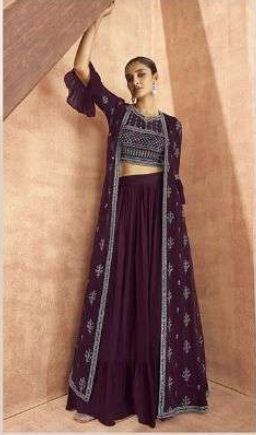
D NO : 9101