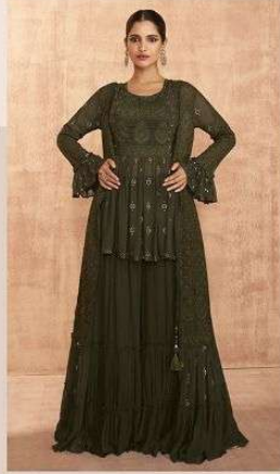
D NO : 9102