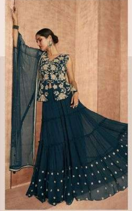
D NO : 9104