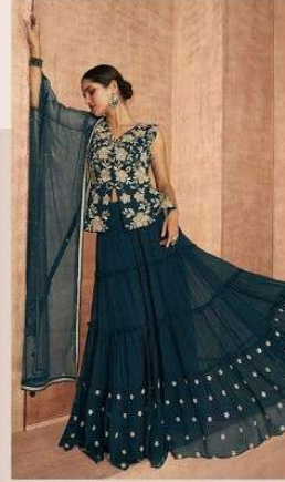
D NO : 9104