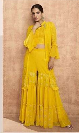
D NO : 9103