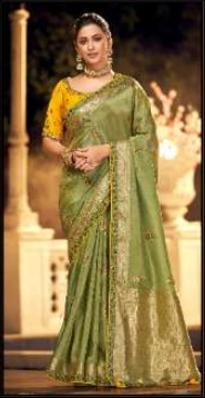
D. NO. : 1504