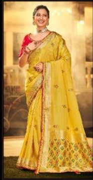
D. NO. : 1506