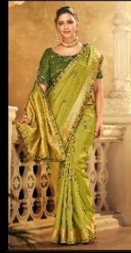
D. NO. : 1508