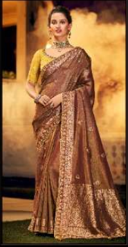
D. NO. : 1501