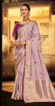
D. NO. : 1503