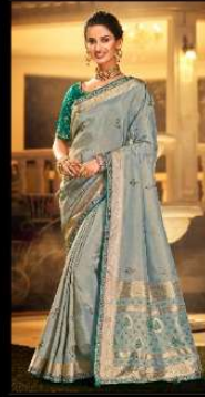
D. NO. : 1507