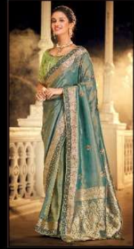
D. NO. : 1509