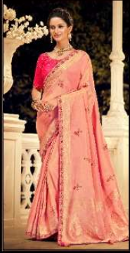
D. NO. : 1502