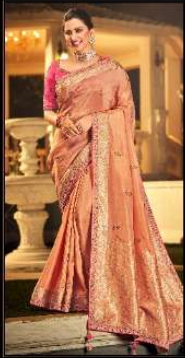
D. NO. : 1505